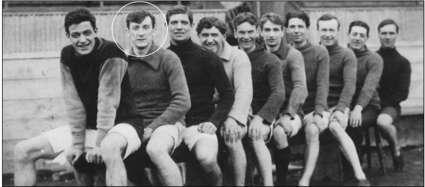
Photographs taken at Croydon Common