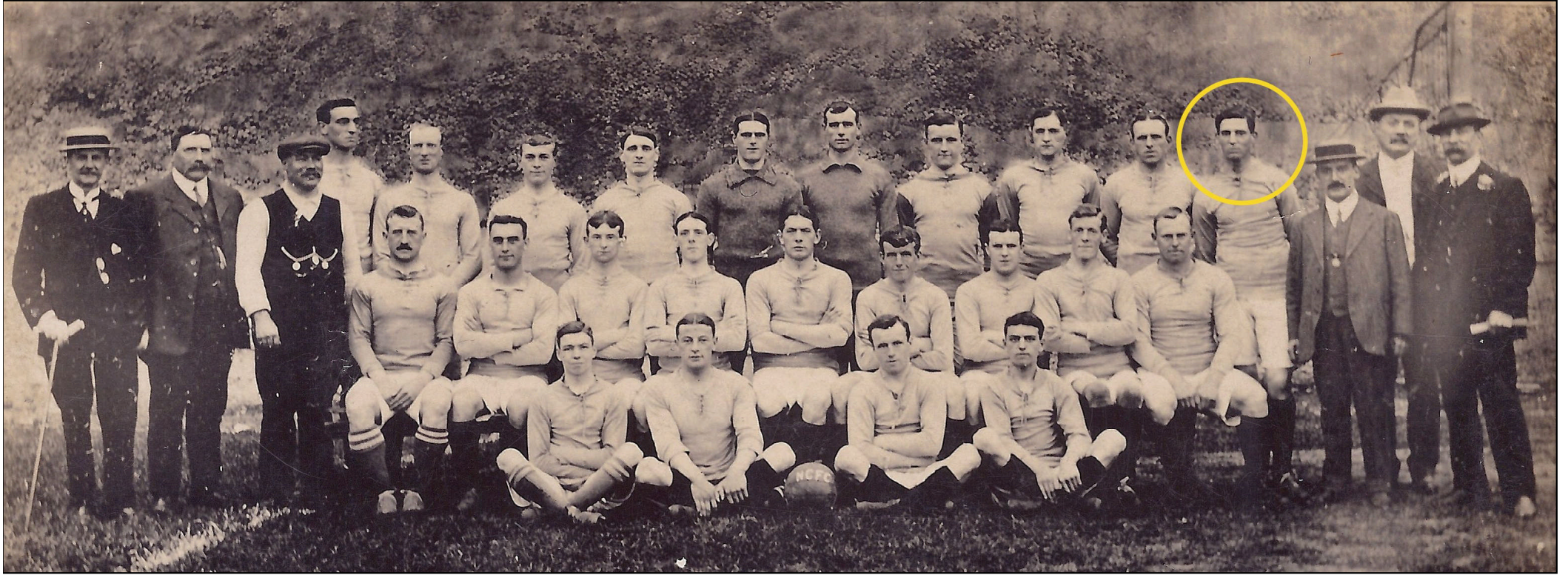
Norwich City 1910-11