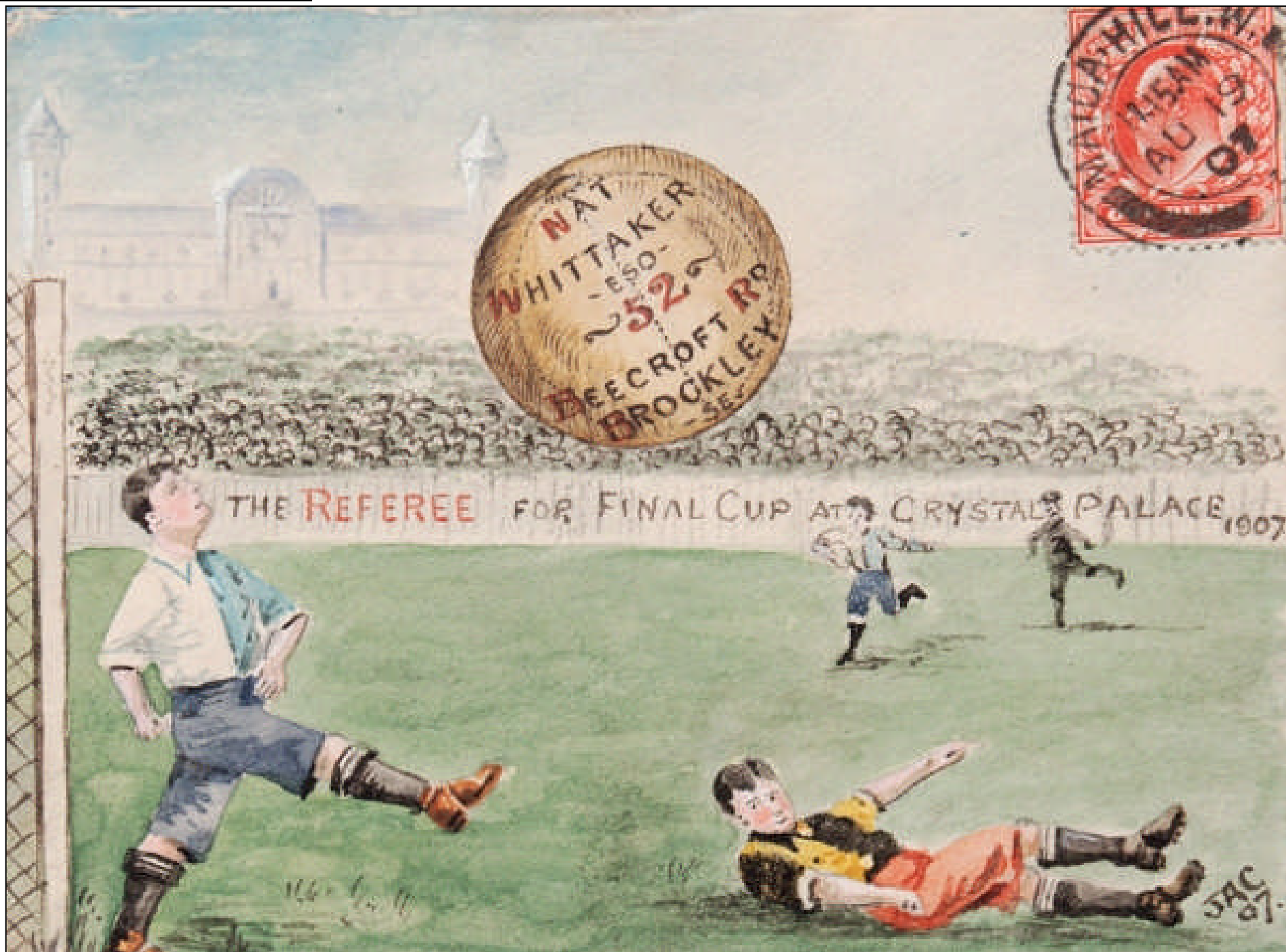
The envelope of a letter sent to him a few months after he had refereed the 1907 F.A. Cup Final