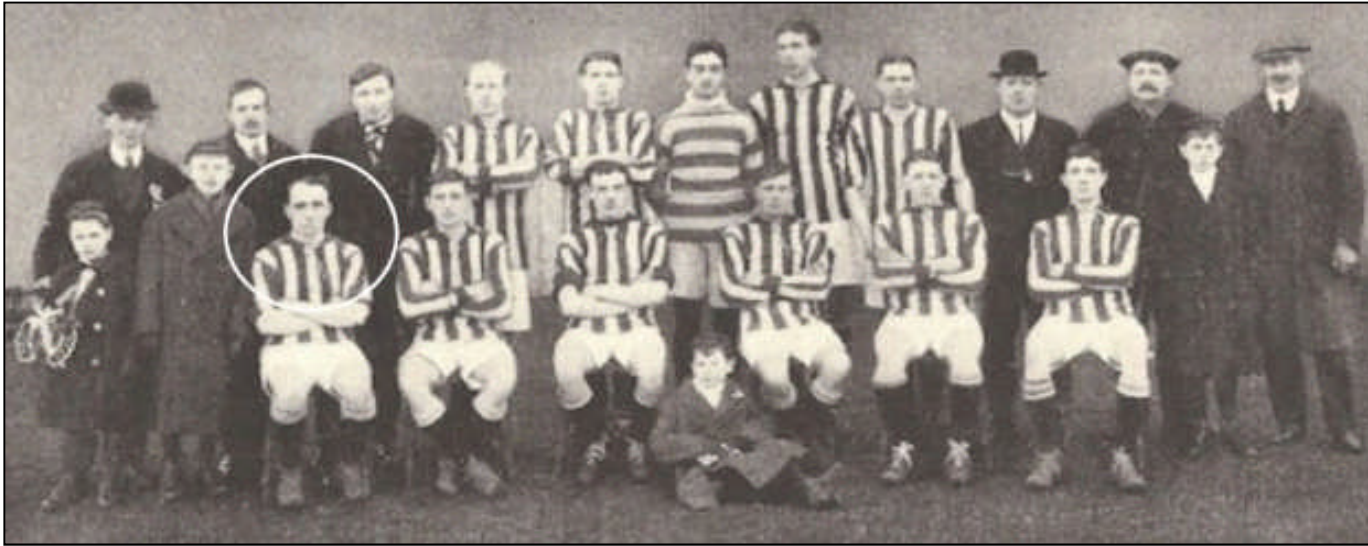
Belfast Celtic 1913-14