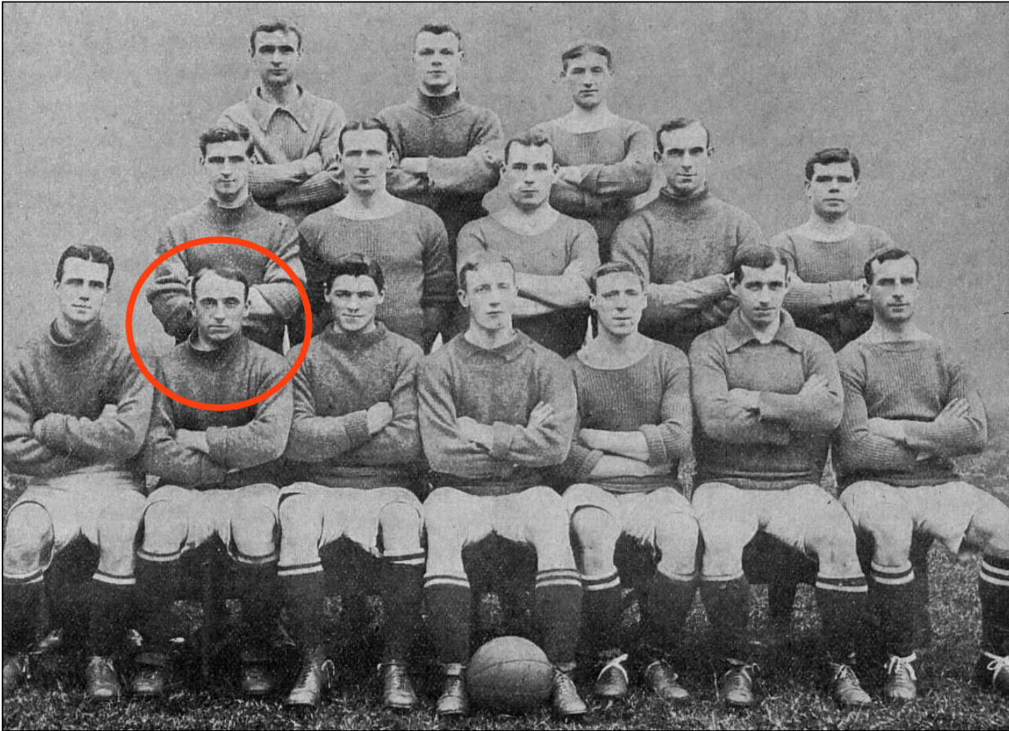
Stockport County 1910-11