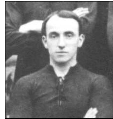
Stockport County 1909-10