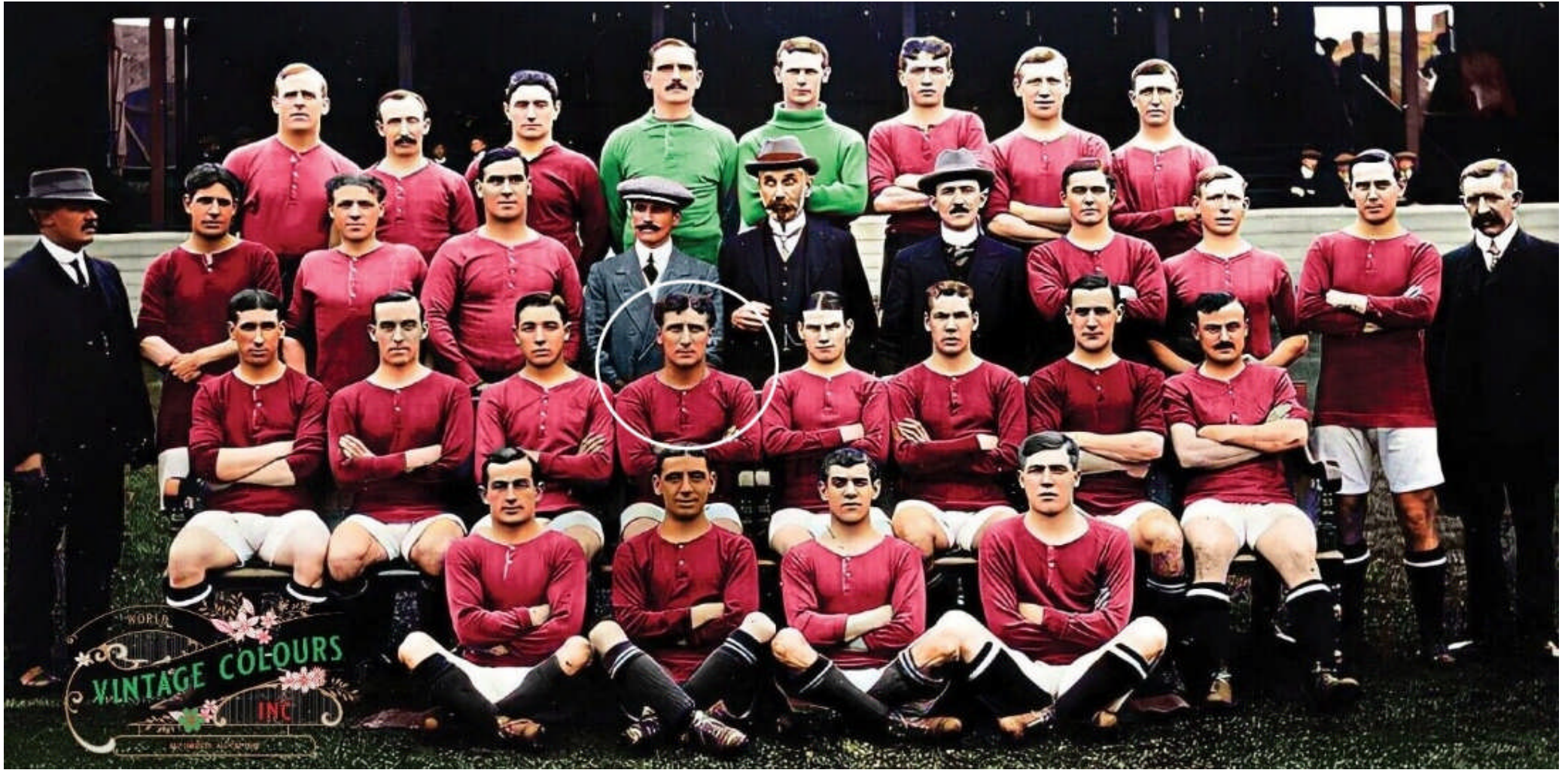
Woolwich Arsenal 1912-13