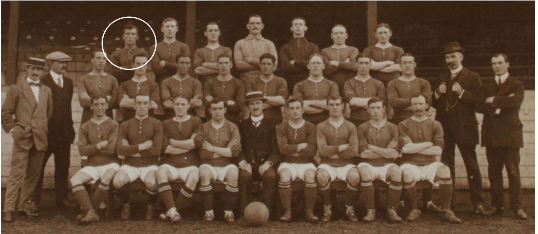
Woolwich Arsenal 1911-12